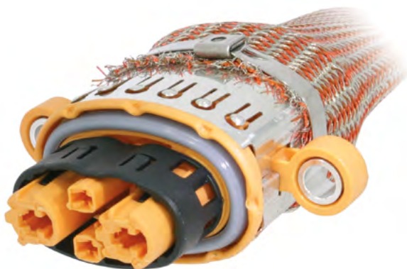
ShieldPack™ HV APEX280 SB DM