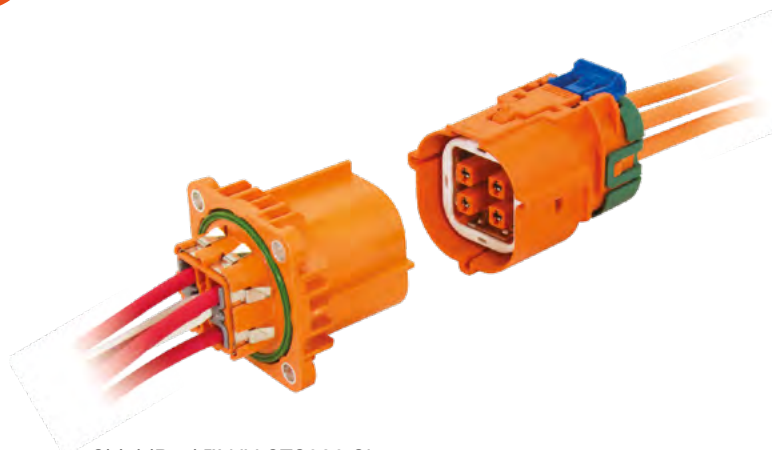
ShieldPack™ HV CTS280 SI